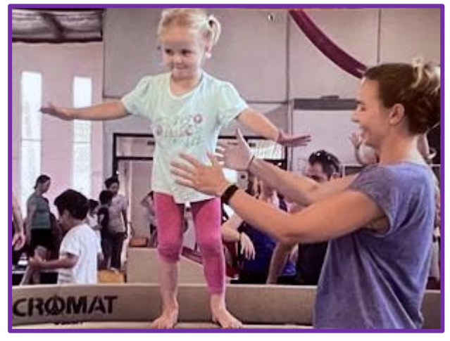
Happy memories of Playgym with my own little gymnast!

(Whānau of ESGC Coordinator and Newsletter writer until someone else volunteers)