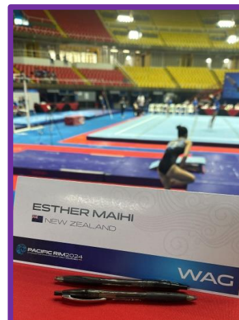
My judging name card.