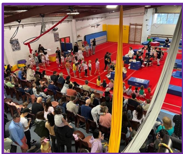
Rainbow Gymfest Term 4 2023

Each level does include more skills than previously, so it may take longer to progress through the colours than it has in the past.