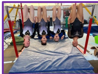
Fun at the STEPS Mock Competition on May 5. These girls work hard, but they know how to play hard too!