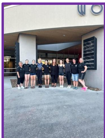
At the World Champions Centre with the team