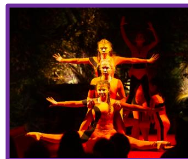
From our 2023 Circus Show "It's a Jungle Out There"