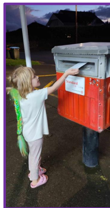
Sending off a letter requesting sponsorship for our Dance Studio renovation project