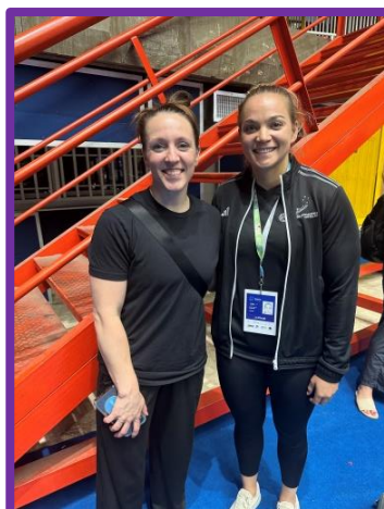
With Olympian and USA Coach Chelsie Memmel.